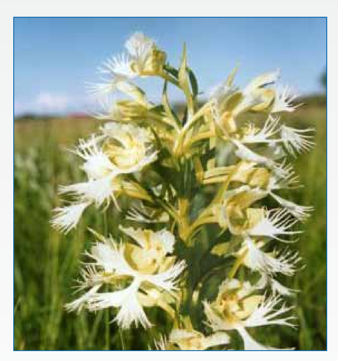
Western Prairie Fringed Orchid